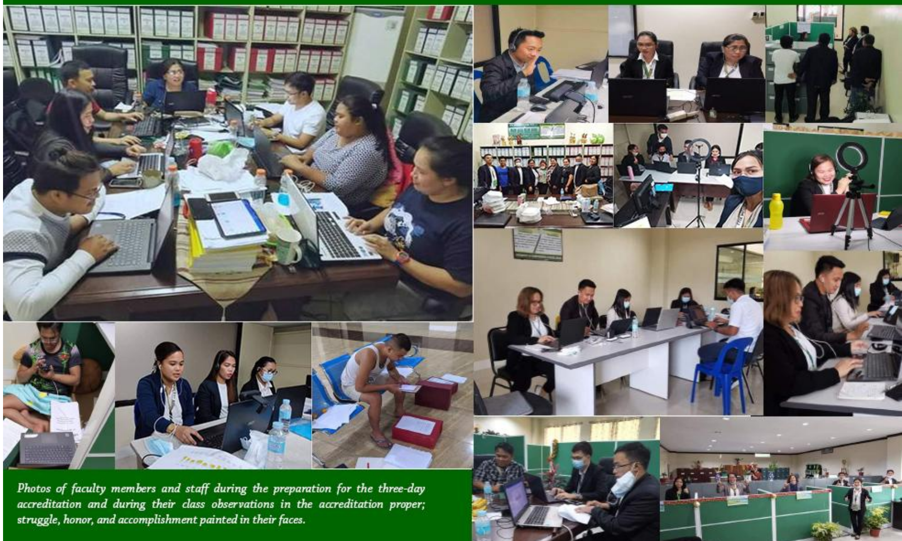
Photos of faculty members and staff during the preparation for the three-day accreditation and during their class observations in the accreditation proper; struggle, honor, and accomplishment painted in their faces.