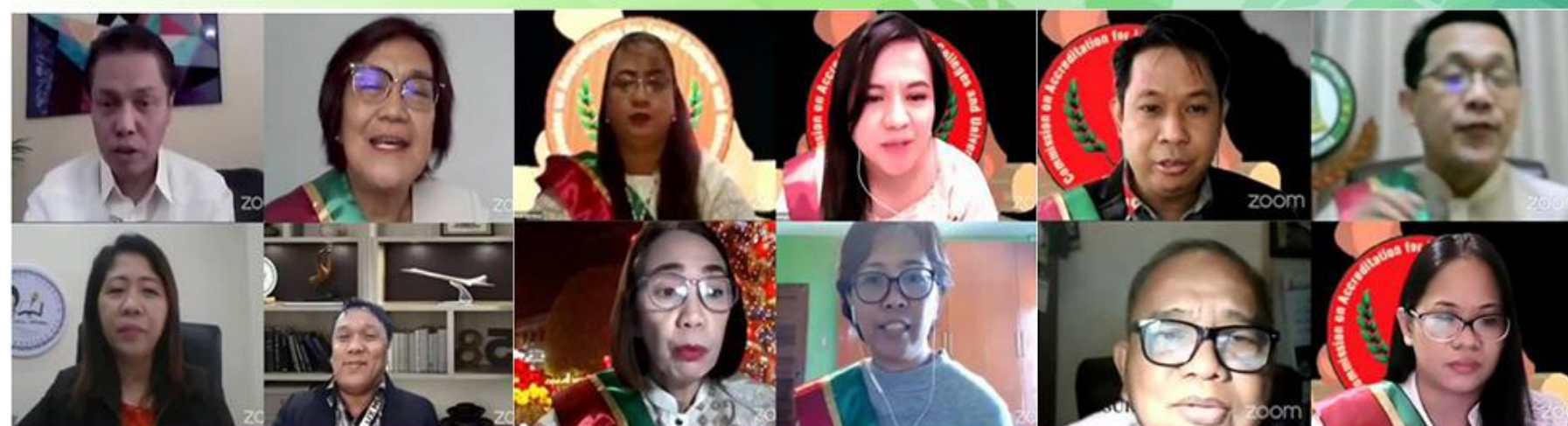
The accreditors of the nine programs of GADTC together with the President of ALCU-COA, and GADTC President and Vice President for Academic Affairs, meet through zoom meeting on the first day of the Accreditation; students witnessed the program through Facebook Live